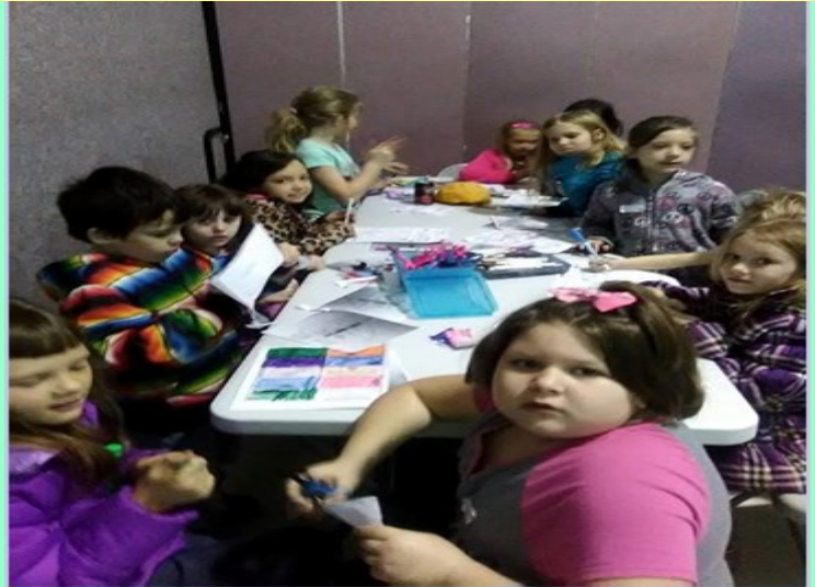
Kids at FBC in Doniphan Kid's Corner at Bread Shed

“because if you confess with your mouth that Jesus is Lord and believe in your heart that God raised Him for the dead, you will be saved. For with the heart one believes and is justified, and with the mouth one confesses and is saved.” ROMANS 10:9-10