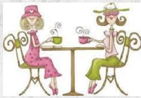
Women on Mission